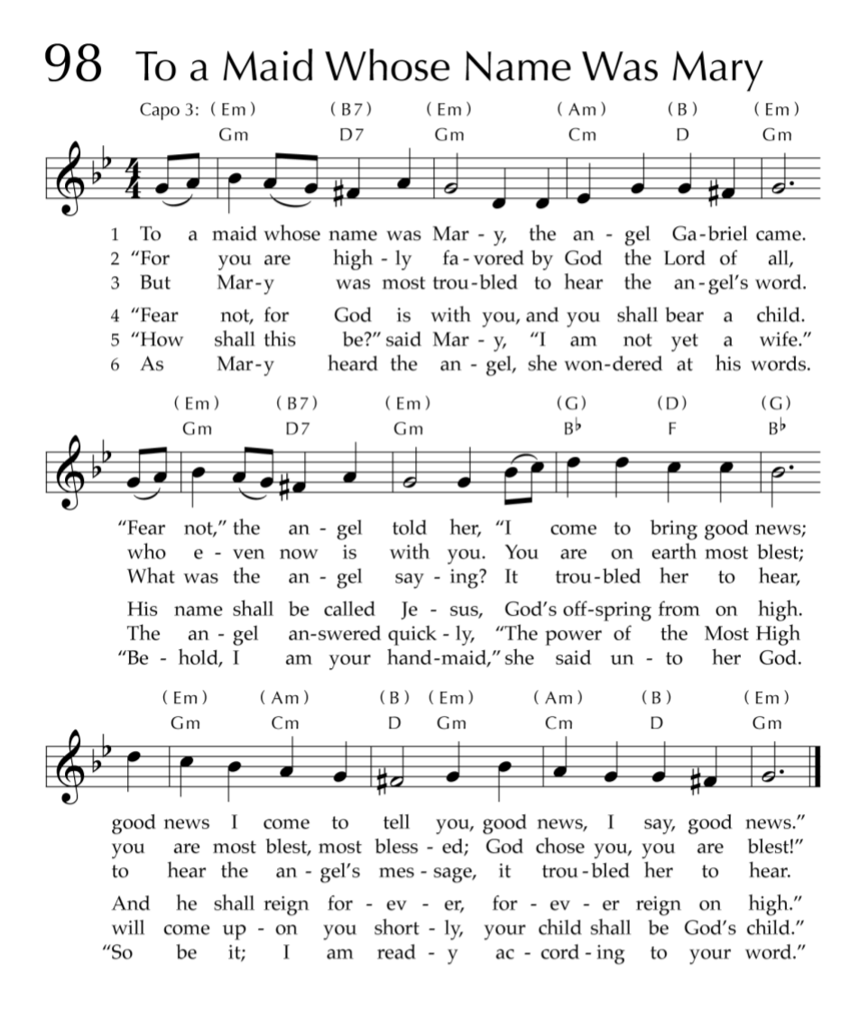
Guitar chords do not correspond with keyboard harmony.

This 20th-century ballad-like retelling of the Annunciation (Luke 1:26–38) displays many characteristics of a folksong style, especially repetition in both text and tune and short quotations included in the narrative. Such features help to make a song both memorable and singable.