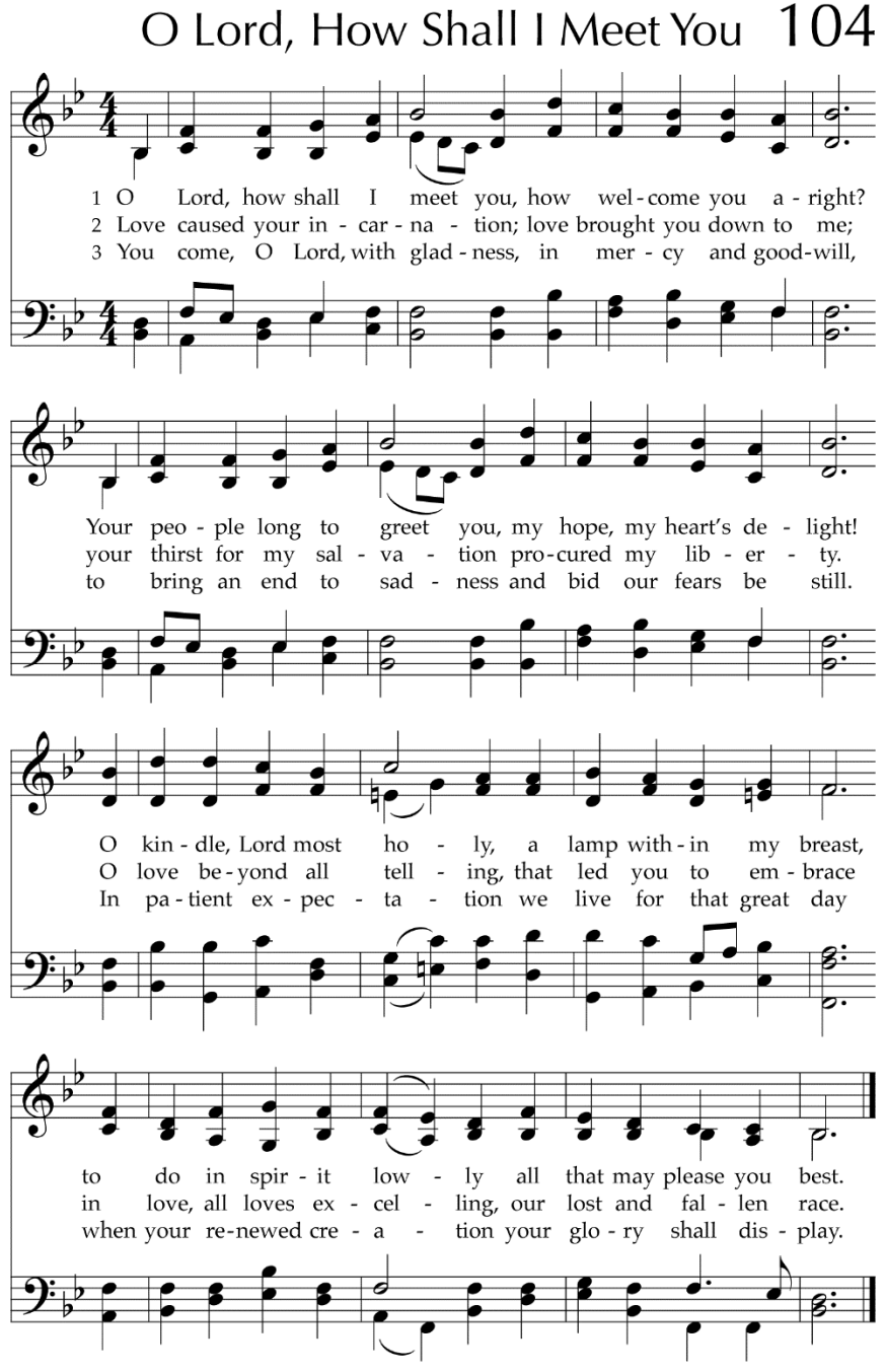
Though many Advent hymns address Christ with entreaty and invitation, this more contemplative text considers how an individual prepares for and responds to Christ's coming. It also brings together a recollection of the First Coming with an anticipation of the Second Coming.