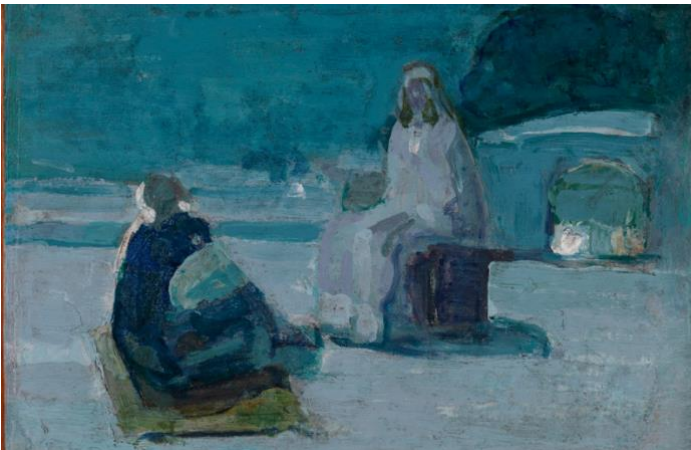
Henry Ossawa Tanner, Study for Christ and Nicodemus on a Rooftop , ca. 1923, oil on wood panel, Smithsonian American Art Museum