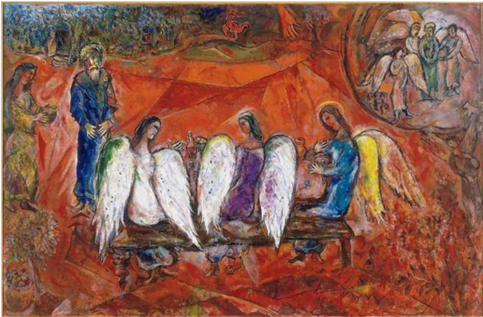
Marc Chagall, “Abraham and three Angels” ( Abraham et les trois anges ) 1966; Saint-paul-de-vence, France