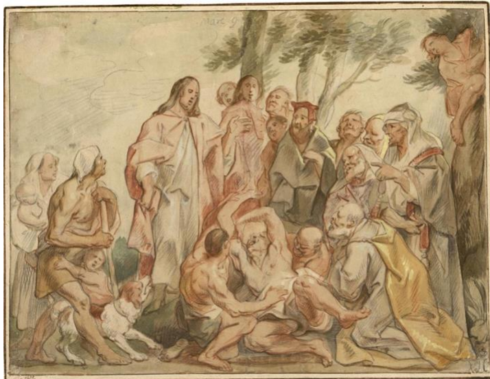
Jacob Jordaens: Christ, Healing the Man Possessed by Devils ; Flanders, early 1650s; black chalk, sanguine, aquarel, gouache; from the Hermitage Museum.