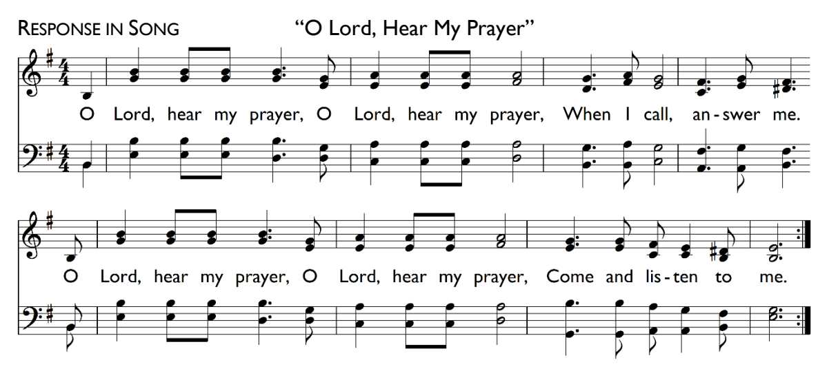
Copyright © 2014 Ateliers et Presses de Taizé. Published and distributed in North America exclusively by GIA Publications, Inc. All rights reserved. Reprinted under OneLicense.net A-725033.