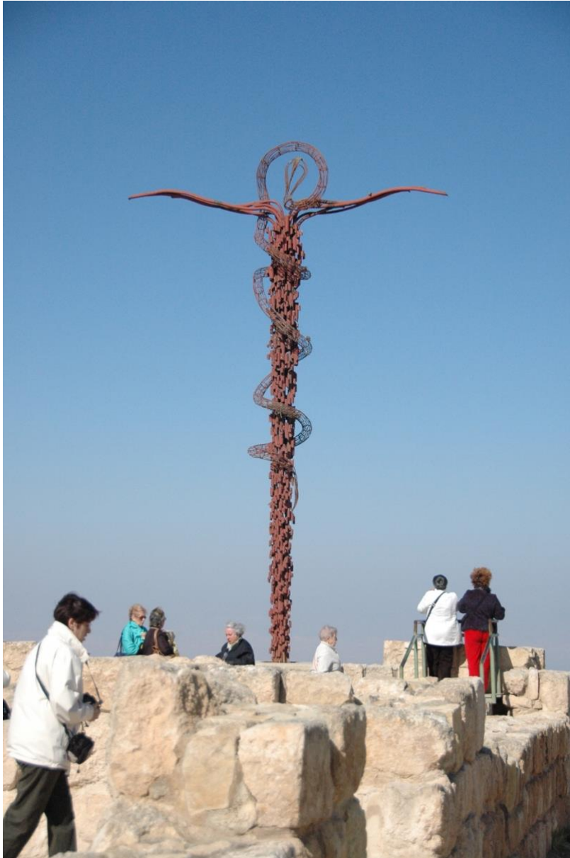
The Brazen Serpent Monument on Mt. Nebo, Hashemite Kingdom of Jordan, near the northern edge of the Dead Sea. The sculpture symbolizes the bronze serpent created by Moses in the wilderness.